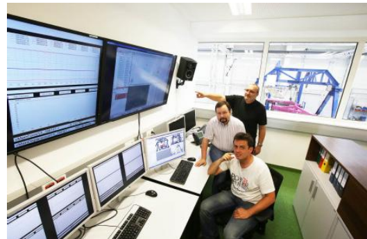
Monitoring in the control room, Photo: CoLT

Safety, efficiency and precision – the core characteristics that distinguish the innovative A350 XWB winglet could be verified by comprehensive component testing.