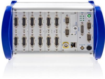
Measurement device: imc SPARTAN

The imc SPARTAN is especially productive by utilizing the imc Online FAMOS integrated real-time analysis in the measurement system.